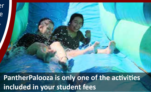
PantherPalooza is only one of the activities included in your student fees

Welcome back to all our students and a special welcome to our new students joining us this Fall. New students enjoyed a tour and a welcome BBQ on August 30th.